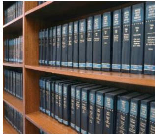
VETERINARY ALUMNI QUARTERLY, VOLUMES 1-3